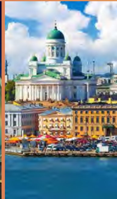
Helsinki Finland April 29, 2018