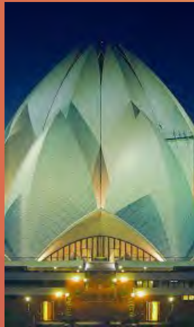
New Delhi India February 2, 2018