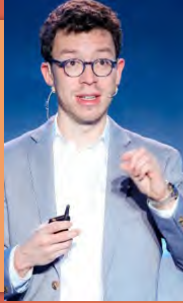
Luis Von Ahn

Director of the Department of Teacher Education of the MOE of P.R.C China