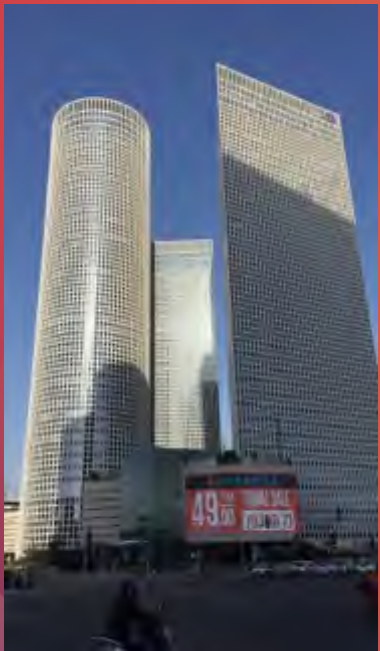
Tel Aviv Israel April 8, 2016

GET has been held in Beijing every fall Since 2015 . With the brand development of GET and the increasing demand for education services globally, GET started to launch in other countries from 2016.