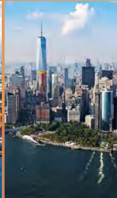
New York United States May 28, 2018