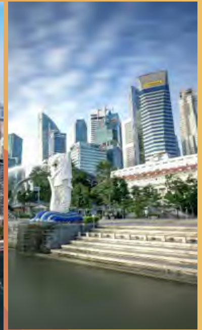
Singapore August 2, 2019