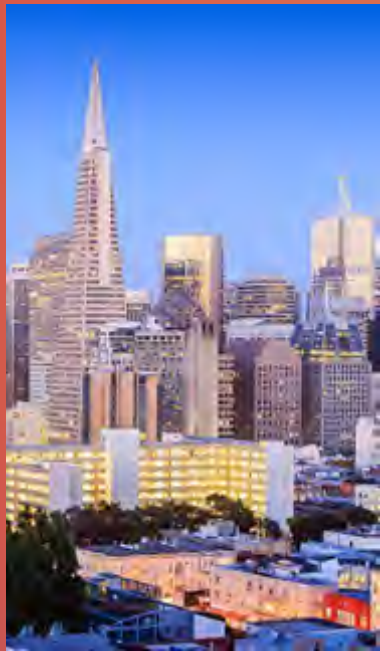
Silicon Valley United States May 3, 2017