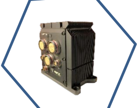
RAPTOR - VNX COTS Computer