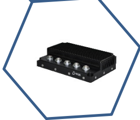
Lanius – ultra-SFF computer