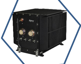
OSPREY – Rugged 3U VPX/ OpenVPX COTS Computer