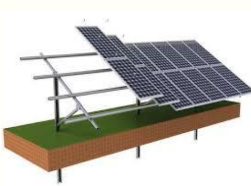
LAND TERRAIN MOUNTING