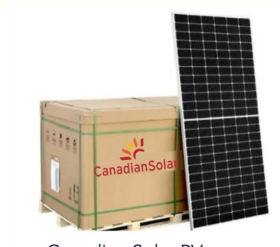
Canadian Solar PV