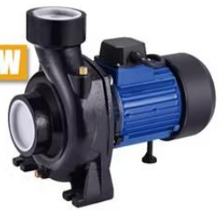
LARENS AC/DC SOLAR CENTRIFUGAL PUMP