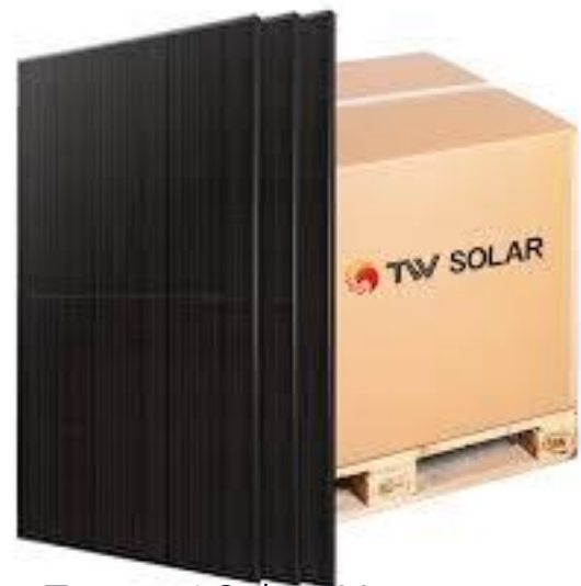
Tongwei Solar PV

Other Brands according to Client's Requirement