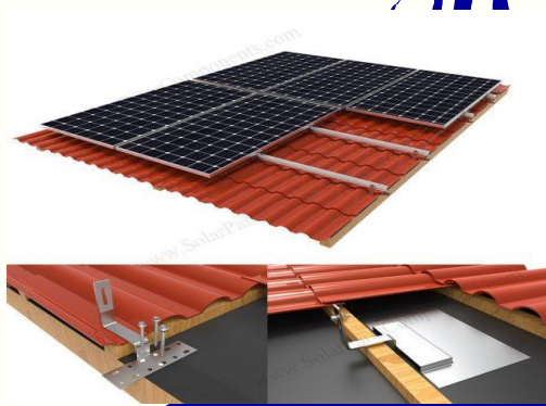
TILE ROOF MOUNTING