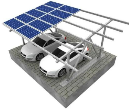
SOLAR CARPORT MOUNTING