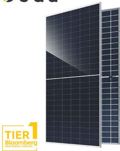
OSDA Solar PV