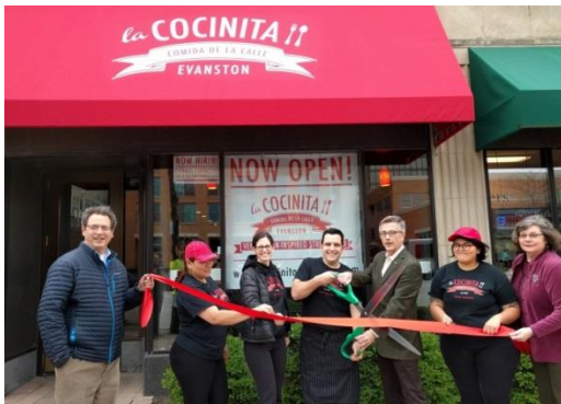
Food truck operator La Cocinita opened its 1st brick and mortar store in Downtown Evanston.

Threads Boutique – 1304 Chicago Ave. Sketchbook Brewing Co – 827 Chicago Ave. Whiskey Thief – 616 Davis St. Life is Good – 1741 Sherman Ave. Lavish Hair Lounge – 814 Dempster St. Auto Finance Chicago – 2421 Dempster St. Hyatt House – 1515 Chicago Ave. Gotta B Crepes – 1601 Simpson St. Cellular Connection – 630 Davis St. Dave's New Kitchen – 815 Noyes St. La Cocinita – 1625 Chicago Ave. Ala'Nis Couture – 707 Washington St. Soma Vida Pain Relief – 2000 Maple Ave. Flaherty Physical Therapy – Chicago Ave. Dreamtown Real Estate – 1567 Maple Ave. Pita 1 – 1926 Central St. MSI Healing – 2114 Ashland Ave.