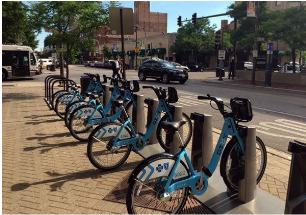
Divvy Bikes arrived at 10 Evanston stations in June, including this one near the Davis Street CTA station in Downtown Evanston.

The second quarter of 2016 brought many exciting new developments in Evanston. New business starts combined with expansions and relocations of existing favorites brought the total number of business openings to 17 for the second quarter, compared with only 14 during the same period last year. Real estate sales remained consistent with the same period last year and commercial vacancy rates remained lower than those of nearby market areas.