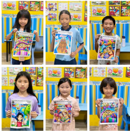
Mother's Day Colouring Contest