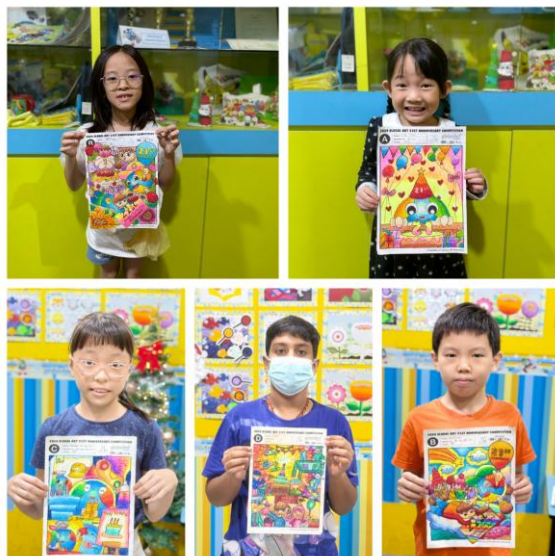
21st Anniversary Art Contest