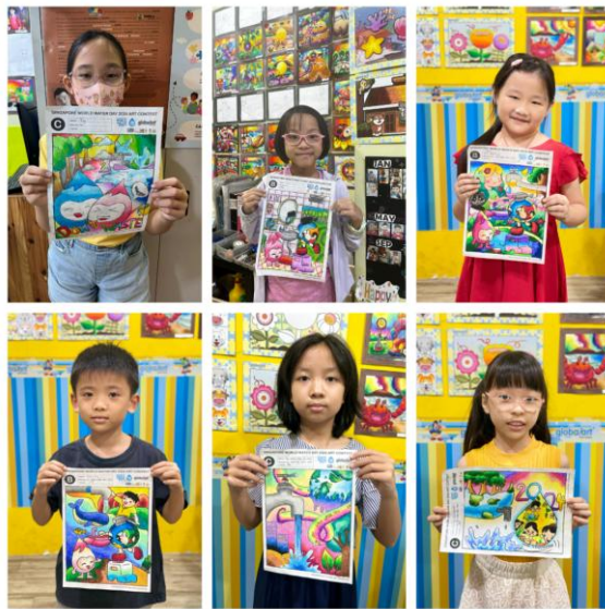
PUB Water Day Contest