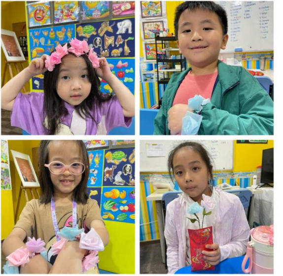
Mother's Day Craft