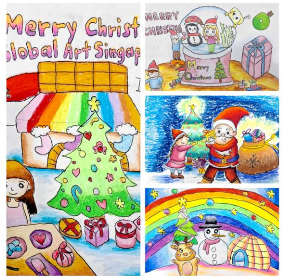
Christmas Card Design Contest