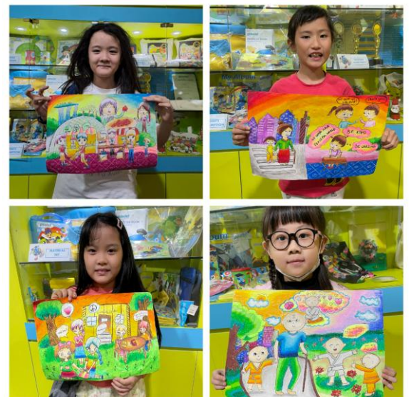
Maha Bodhi Competition