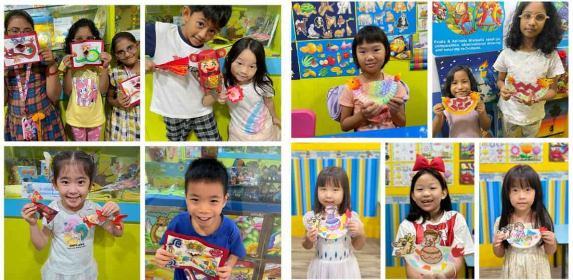
Chinese New Year Crafts

Our art lessons offer more than just artistic skill-building; they provide opportunities for cultural exploration and celebration.