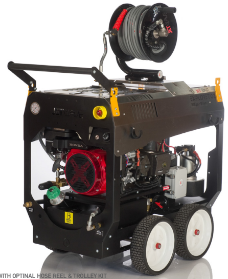
SHOWN WITH OPTINAL HOSE REEL & TROLLEY KIT

The Jetwave® Explorer™ G2 heavy duty professional hot water petrol powered by HONDA™ pressure washer revolutionary in its design and innovation. Australian engineered and assembled using only the best quality Italian and global components; it offers world first compact multi configurable modular design & cover protection to maximise safety, functionality and efficiency.