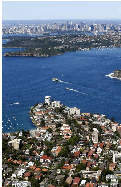
Manly looking towards the city, could be the next Silicon Valley.

Now he wants to replicate that formula on the beaches with the launch of Northern Beaches Angels.