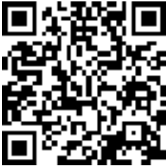
ANNUAL CONFERENCE DIGITAL SOUVENIR JOURNAL