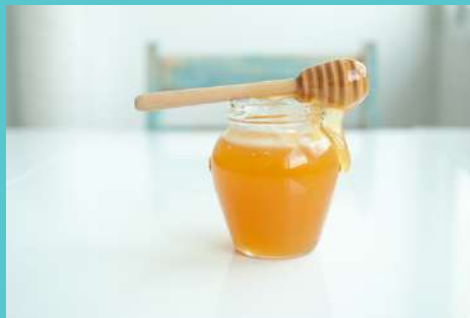
a jar of honey