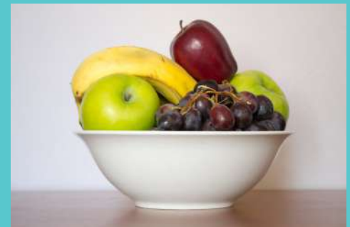
a bowl of fruit