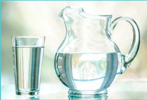
a pitcher of water

We often use expressions of quantity with countable/uncountable nouns.