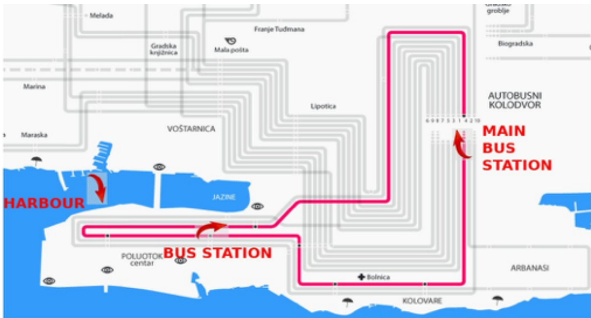
Bus line 4