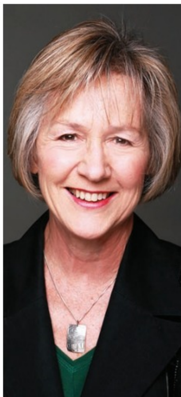
JOYCE MURRAY, MINISTER OF FISHERIES, OCEANS AND THE CANADIAN COAST GUARD, DECIDES NOT TO RUN AGAIN IN NEXT ELECTION