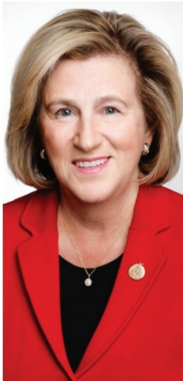
FEDERAL PUBLIC SERVICES AND PROCUREMENT MINISTER HELENA JACEK WILL NOT SEEK RE-ELECTION