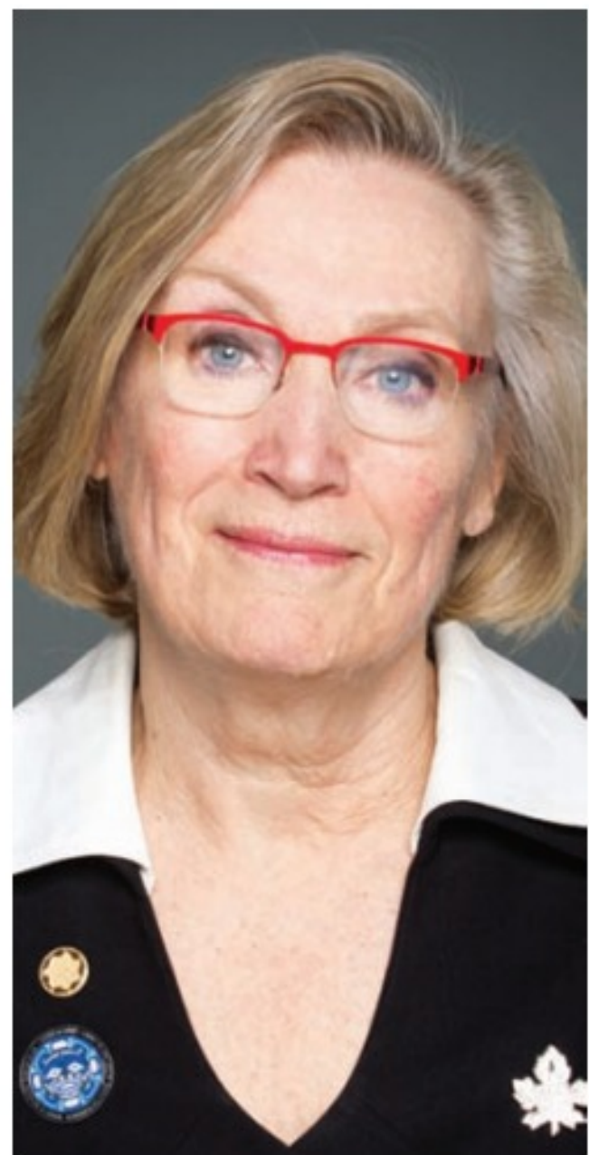
CANADA'S MENTAL HEALTH & ADDICTIONS MINISTER CAROLYN BENNETT ANNOUNCES SHE WILL NOT STAND FOR RE-ELECTION