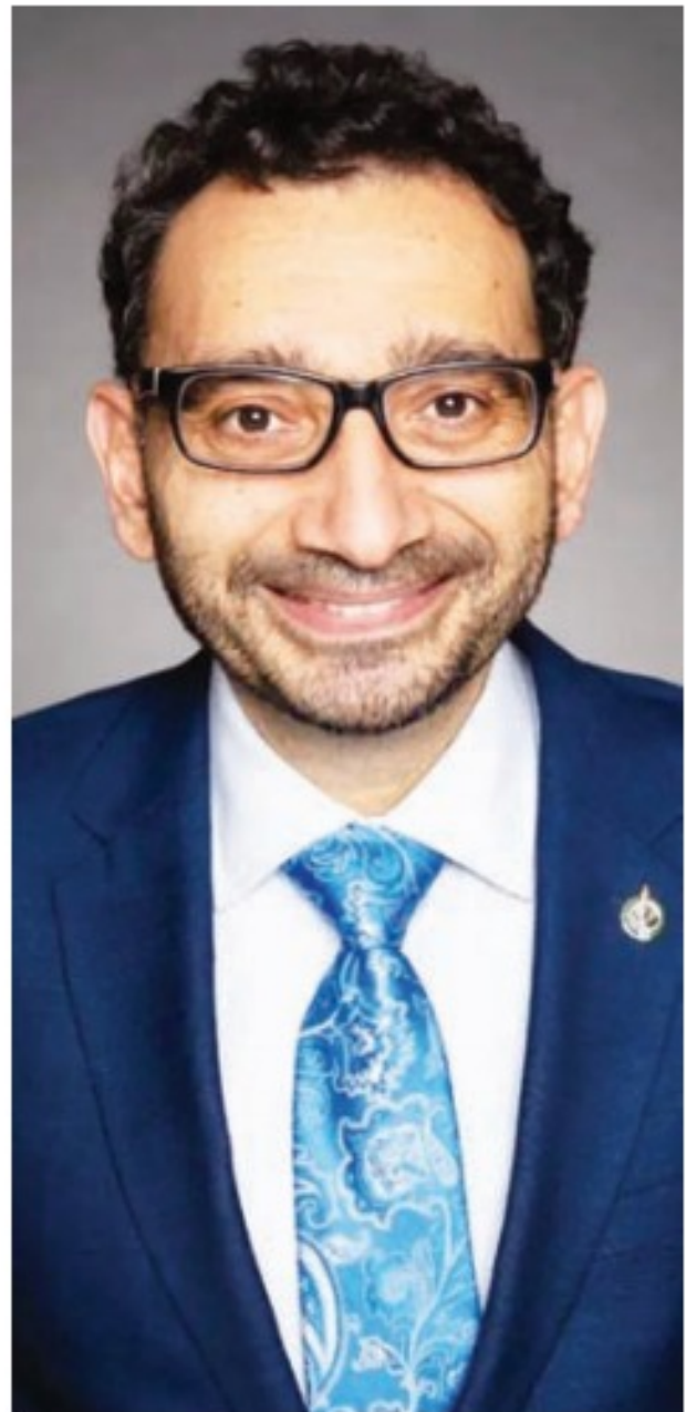
FEDERAL TRANSPORT MINISTER OMAR ALGHABARA WILL NOT BE SEEKING RE-ELECTION; WILL BE STEPPING ASIDE FROM CABINET