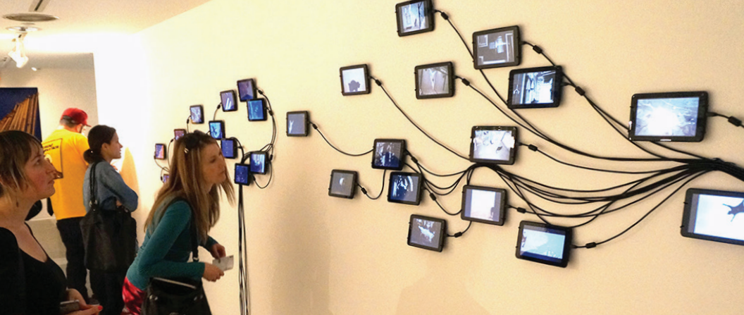
The life cycle of toxoplasma gondii . Photo by Rachel Mayeri