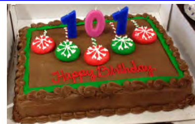
Yummy looking cake.