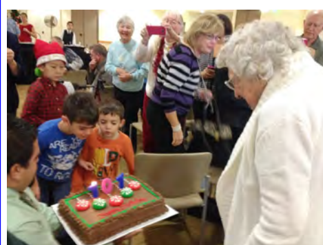
A couple of little ones helping with blowing out the candles.