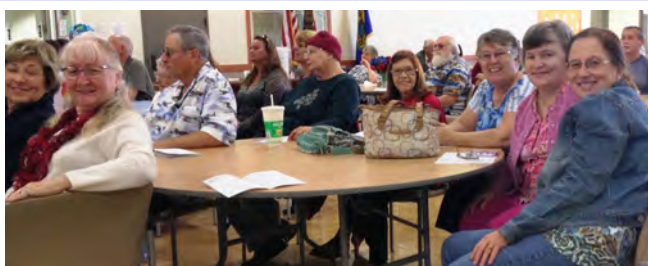
Some of the people who were there to enjoy it with her. Recognize some guild members?