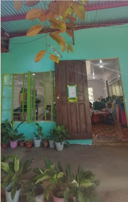
NAILON'S KINDERGARDEN CLASSROOM