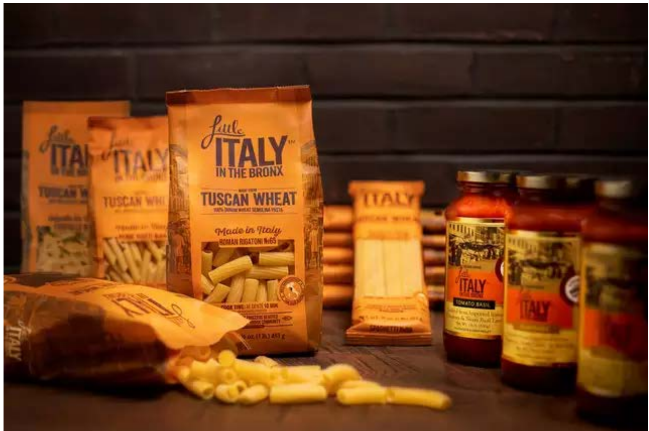
The Little Italy in the Bronx Collection