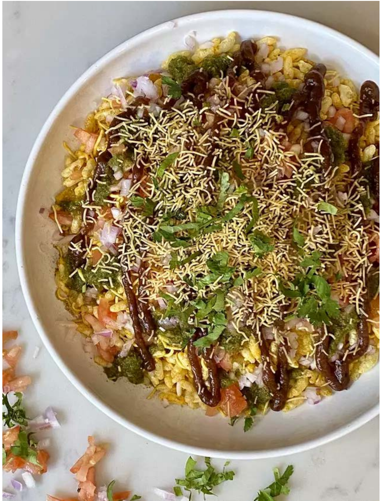
Desi Galli's Bhel Puri Meal Kit