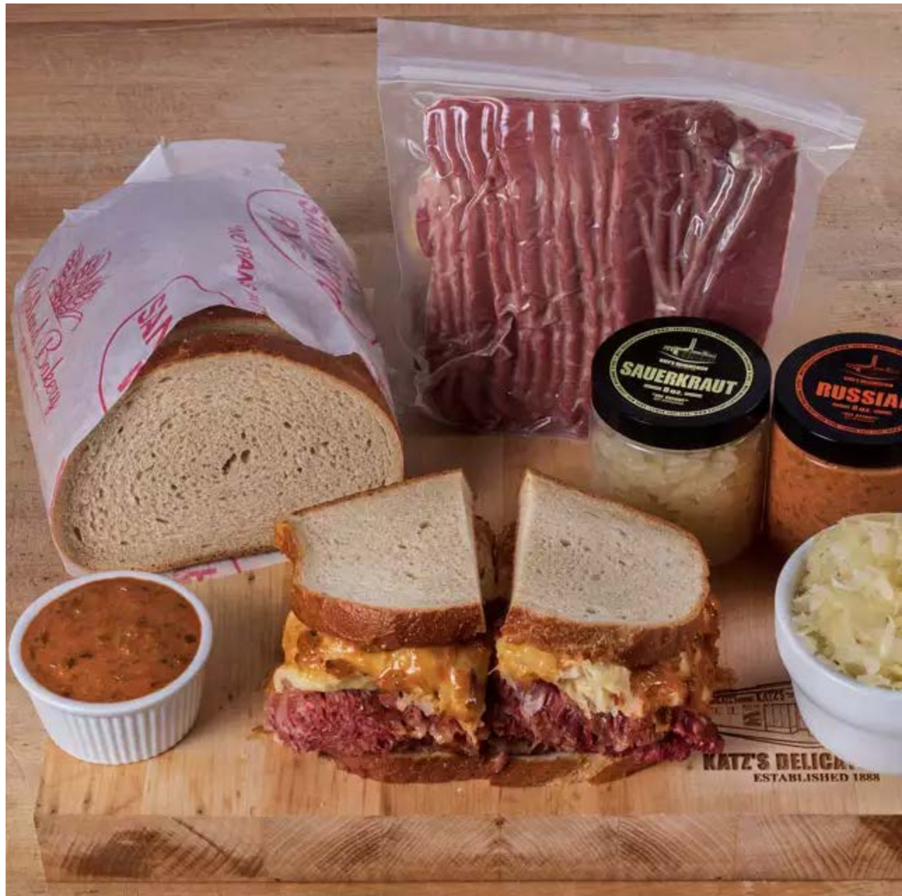
Katz's Reuben Package