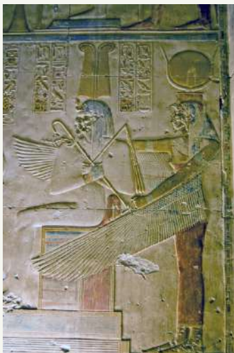
Music of ancient Egypt

We use music in many different ways and for various reasons. Musical instruments have a remarkable ability to make humans feel emotion. Many religions around the world use musical instruments during their services. Some cultures believe musical instruments have magical powers. Drums have been used to make evil spirits go away. They have been used to announce the arrival of kings and in battle with armies. Of course, musical instruments are used for entertainment and pleasure worldwide.