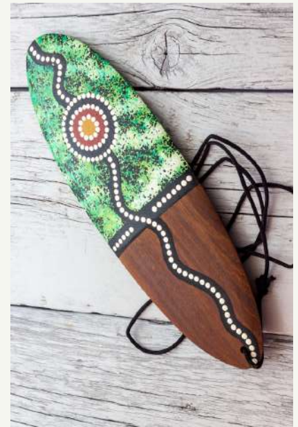
Modern version of the bullroarer

Humans have been very creative when making musical instruments throughout history. The "bullroarer" was made from an animal bone with a hole in one end. They would attach a string and swing it in a circle above their heads to make sounds. Whistles and horns have been made from bird bones, seashells, and animal finger and toe bones. Animal teeth would be put inside of gourds or nutshells and used as rattles . The first string instruments probably came from bows used for hunting originally.