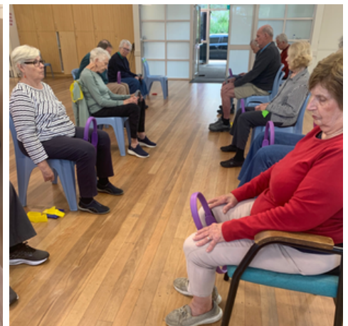
The class using the pilates rings for adductor squeezes