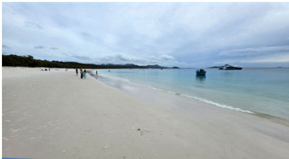
Whitehaven Beach on a cloudy day