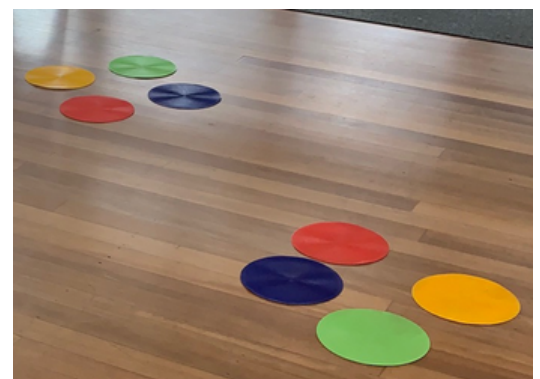
Floor markers for footwork drills