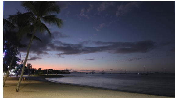
Airlie Beach at sunset