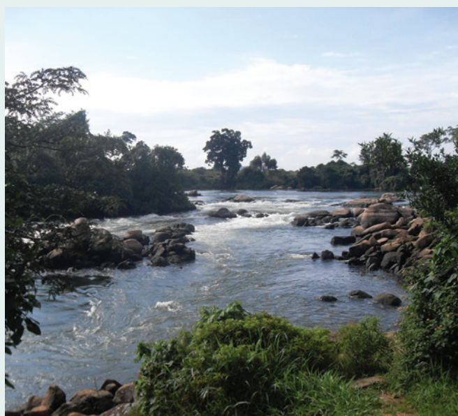
River Nile at the Bujagali falls

A biodiversity offset project is already in place to offset the flooding of iconic waterfalls and river banks by the controversial Bujagali hydropower dam on the River Nile. The biodiversity offset was a condition for World Bank funding of this controversial project. But when another company received planning permission for another dam that would flood the biodiversity offset site, the Bank agreed to the flooding of the site that was to have been protected 'in perpetuity' (see page 23). 31