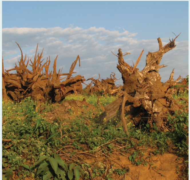
Deforestation around Pakke Tiger Reserve, India Nandini Velho

The way that biodiversity offsetting or similar compensation offsets are embedded in environmental regulations varies from country to country, as does the terminology used to describe it. Some regulations started out with area-based compensation payments that were quite different from biodiversity offsets which pretend to be based on equivalence between the offset area and the area that is being destroyed. Subsequent revisions, however, turned these compensation provisions into mechanisms that adopt an offset logic and use economic valuation language associated with the financialization of nature . The selection below describes some approaches and language used to anchor biodiversity offsetting and similar schemes in environmental regulation.