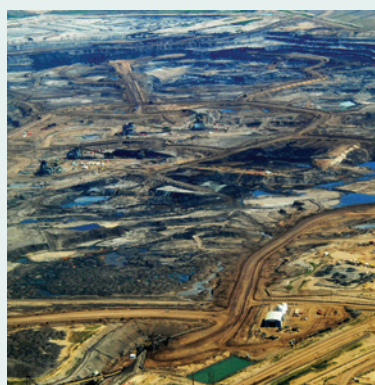
Tar sands, Alberta, Canada