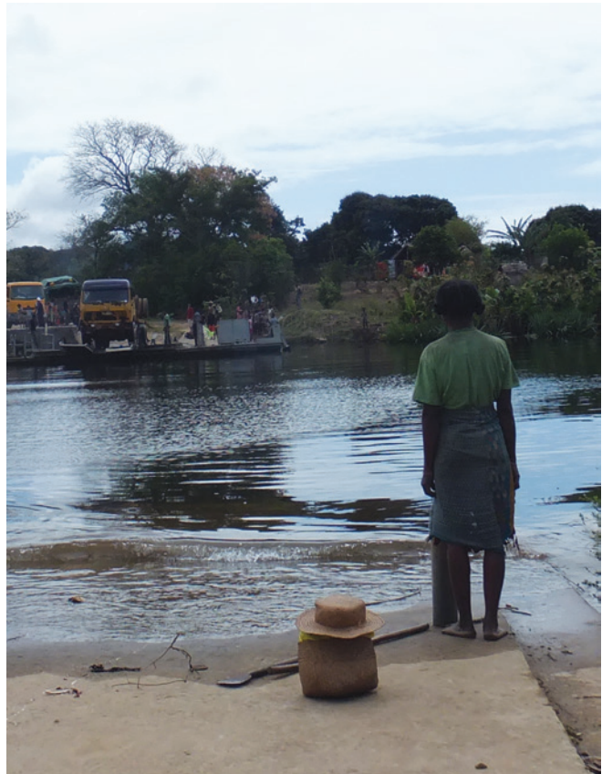
World Rainforest Movement / Re:Common

In essence, biodiversity offsetting and similar compensation offset schemes allow more pollution and destruction today on the promise to restore or prevent planned destruction elsewhere, in future. Offsetting leads to more, not less ecological destruction, causes more pollution, and amounts to a double land grab because corporations end up controlling land use at two locations — the site they are destroying and the location they are claiming as offset. This is the case whether the offset is for biodiversity, carbon from land-based projects or forest restoration.