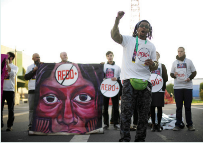
'No REDD' action at COP 21, Paris, 2015