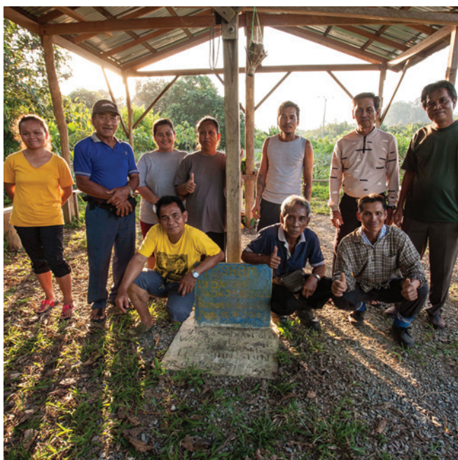
Community agroecology and agro-forestry project, Sungai Buri, Sarawak, Indonesia

Success or failure of REDD+ is not determined by its contribution to halting deforestation, but whether it helps further shift control over territories from communities to corporations and governments