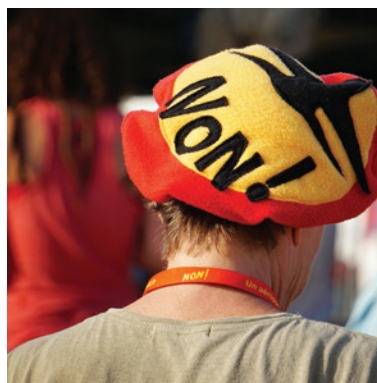
Notre-Dame-des-Landes airport campaign Jim Delémont