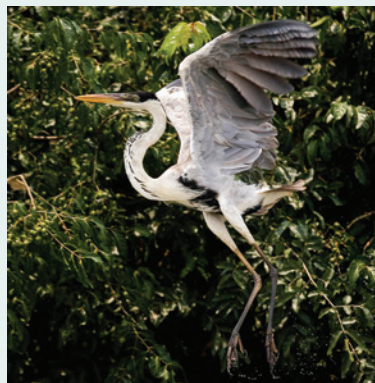
Heron flying over Kikretum Village in Para, Brazil André Porto