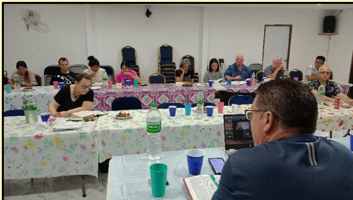
Wednesday night Bible study is growing.