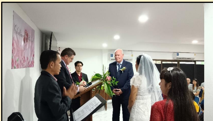
A wedding at our church on Sunday Oct. 20 th .