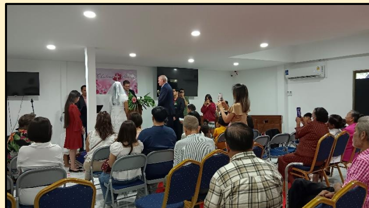
Members and guests joined the worship before the wedding.