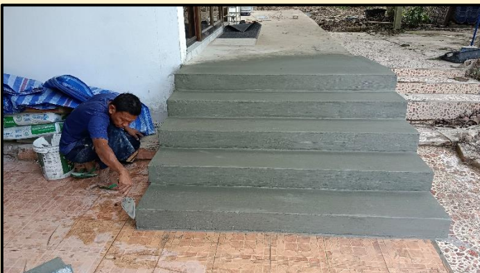
We built a nice set of stairs to lead up to the church.