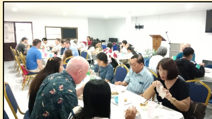
We enjoy the fellowship at lunch time after the worship.