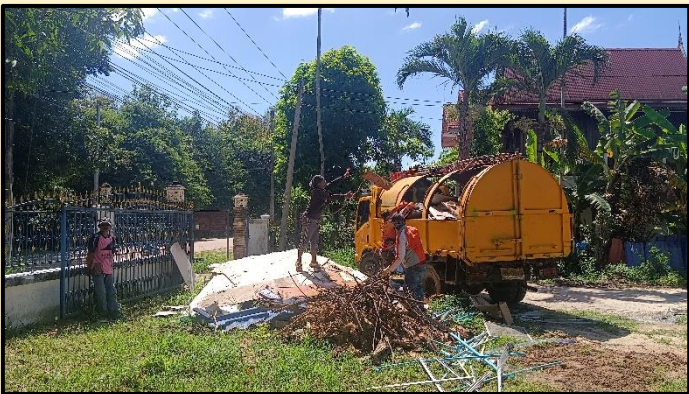
The construction trash was finally removed.