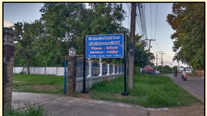
The second church sign was put up on the other side.