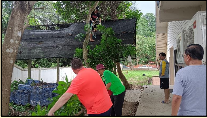
We trimmed branches before rebuilding the hut.