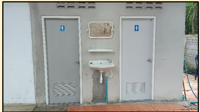
The 2 outside bathrooms were finished.