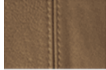
Difference in grains