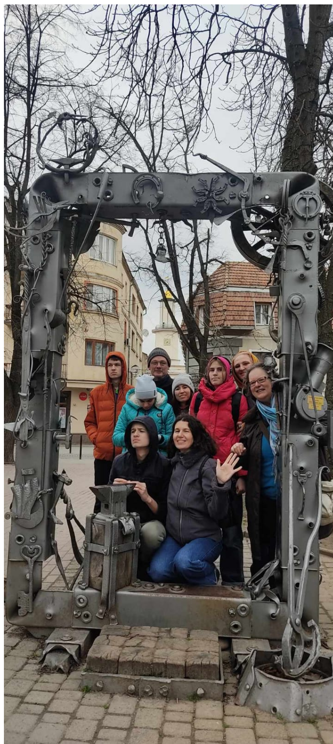
Above top left: Doves linked to Ukraine with red cords Above top right: Posing in a Steam Punk picture frame