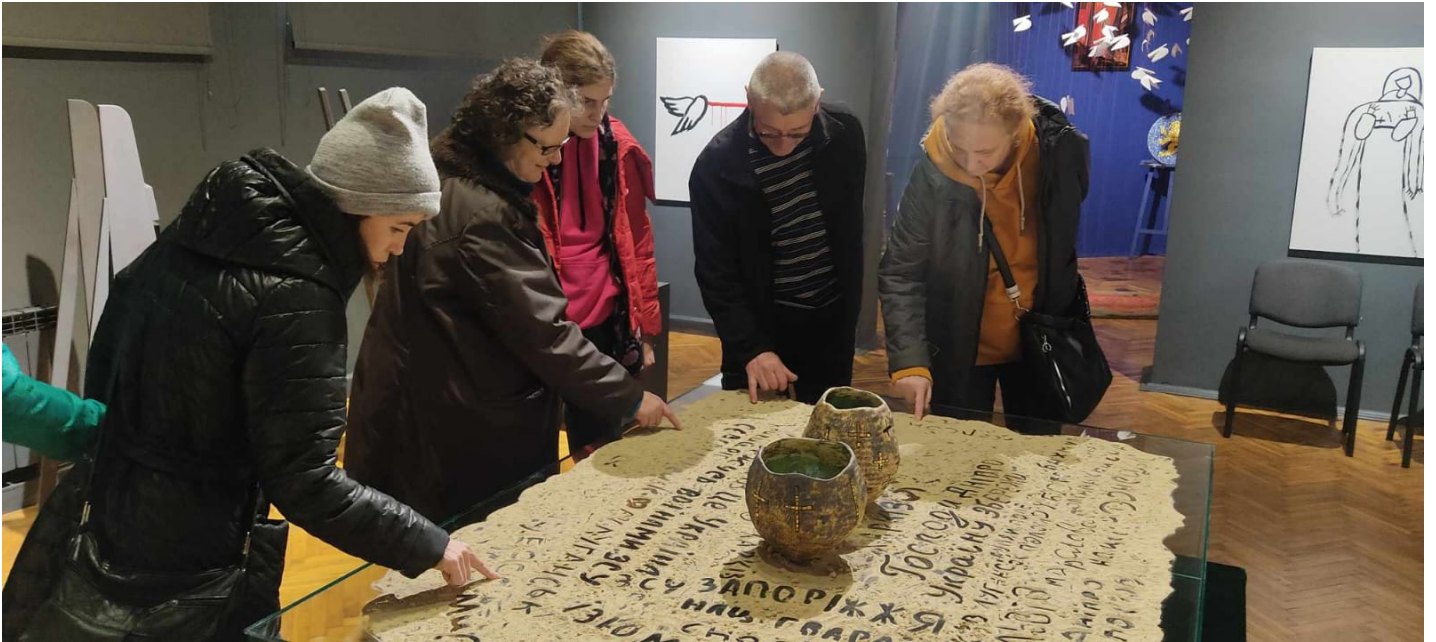
Above: Writing out prayers in the sand.

It was a wonderful time spent with them and we enjoyed each other's company and laughed together. For us, it is so difficult turning around at the end of the day and driving over the border to another world. On our return trip to the Isle of Man, we visited the London Transport Museum to view an exhibition comparing the WW2 blitz, when people sheltered in the underground stations to today's population taking shelter in the Ukraine Metros.