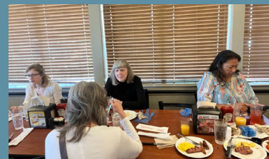
Created in His Image Women's Ministry brunch at Golden Corral