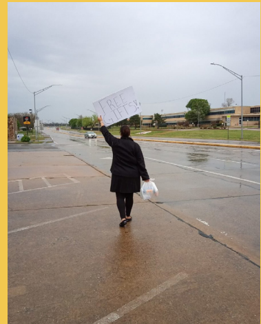
One Team Outreach hand out gifts of love to the Lawton-Fort Sill community.