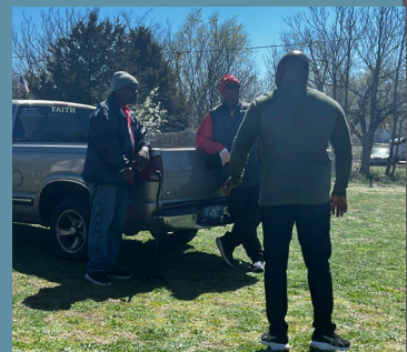
Men Reunited Fellowship at Abundant Life Counseling for a day of unity