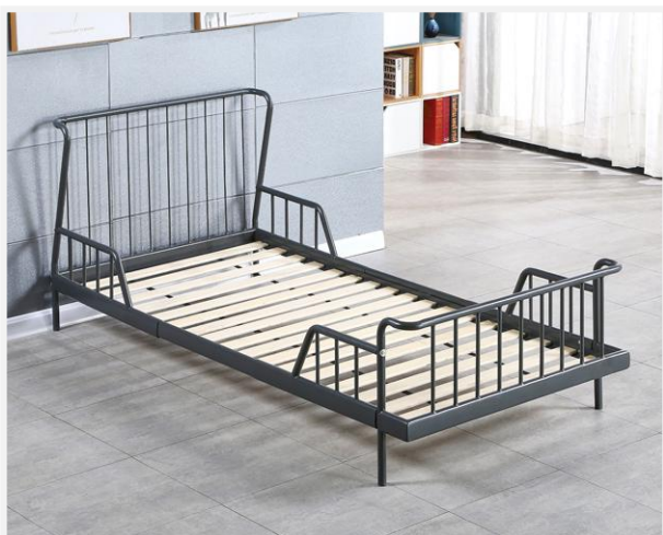
LT1775 Extendable Bed