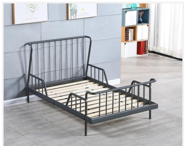
LT1775 Extendable Bed