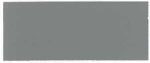
PEWTER GRAY (SP only)