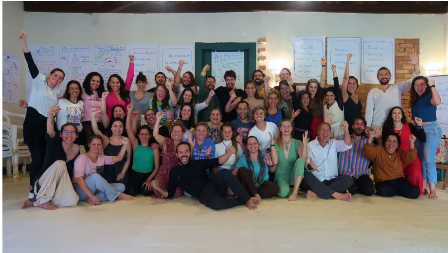
Expand The Box Training in São Paulo, Brazil (June 2023)