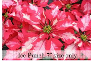
Ice Punch 7" size only