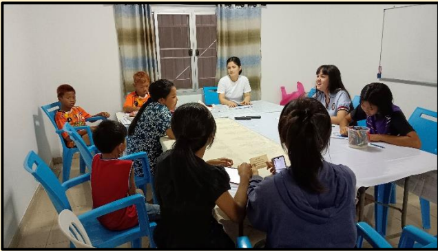
Children always study God's Word after the worship.