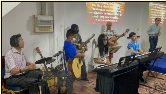
Our worship team has talented musicians.