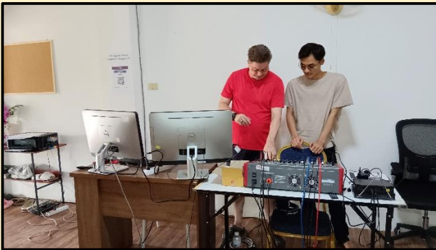
He is teaching a member to manage the sound system.