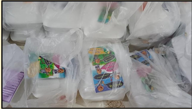
200 people received food and tracts about Jesus Christ.