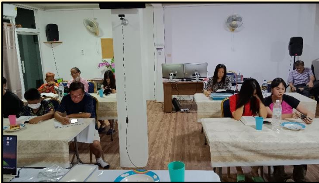
We are learning from Exodus to apply in our lives.