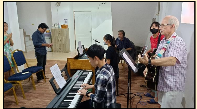
Good music sound helps us worship God better.