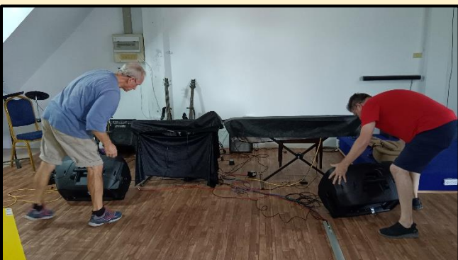
2. God's provision for improving the worship ministry.