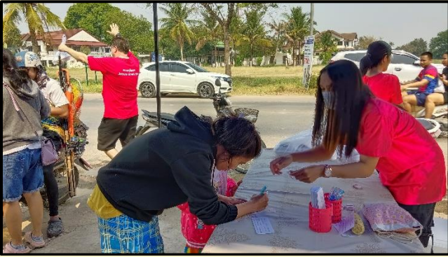
We got their contact numbers before giving them food.