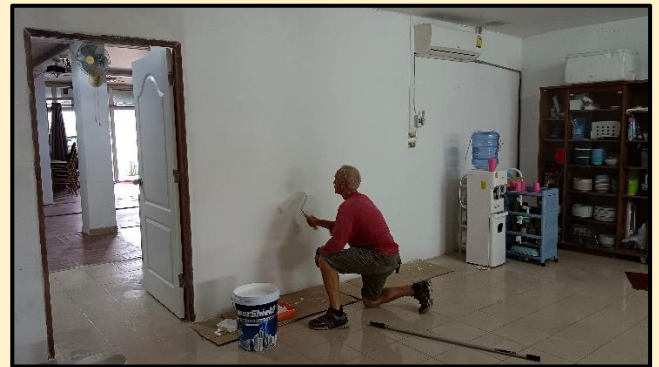
3. The renovation of our church building.