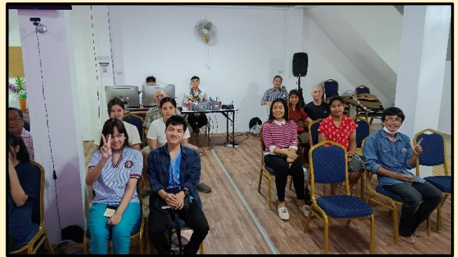
We are international: Thai, Burmese and American.