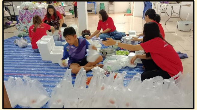
Our members learn to serve God with their gifts.