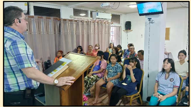
We worship before the children go to their Bible class.