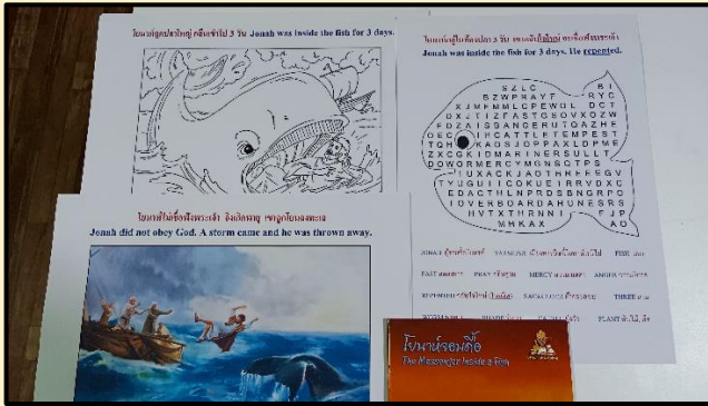
Good Bible lessons are taught every Sunday.