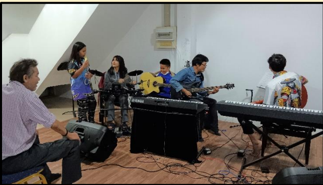
1. New children and youths will become musicians.