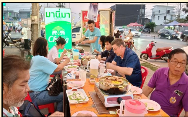
Having dinner with adults before going to America.