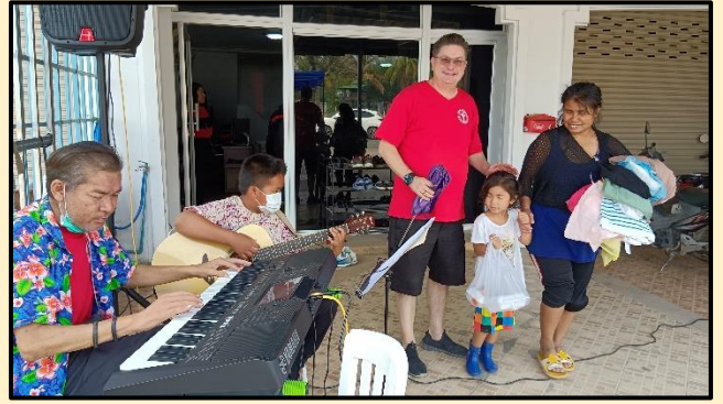
They received food, clothes and encouraging songs.