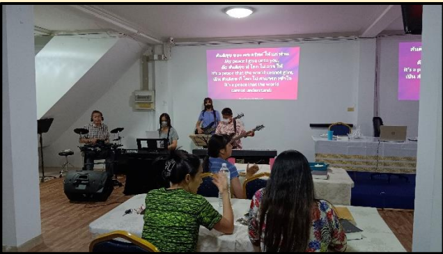
We sing before the Wednesday Night Bible Study.