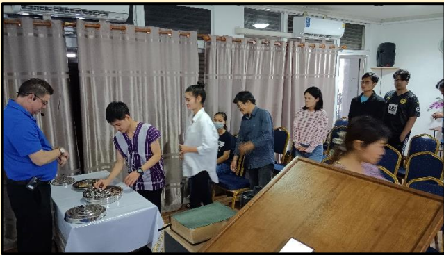
We take the Lord's Supper on every first Sunday.