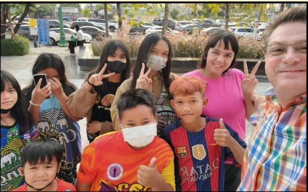
Going out with children on the school vacation.