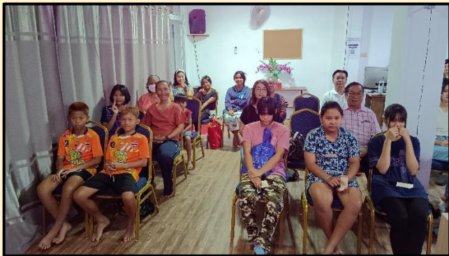
Our church members consist of many age groups.