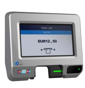
▲ PAX IM20

They are complete communication interfaces, where all your customers' transactional needs can be met in one place.