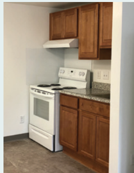
Biltmore Towers residents will enjoy new kitchens, bathrooms, flooring, and lighting.

The rehabilitation of The Biltmore Towers is progressing on schedule as many substantial upgrades begin to take shape in both the interior and exterior of the building. At the time this was written, 52 of the building's 230 units have been renovated with new kitchens, bathrooms, flooring, lighting, and a fresh coat of paint. Other interior renovations include transforming the former hotel's lobby and ballroom into a new amenities space for residents and on-site offices for staff. Exterior renovations include work to the roof and renovations to the building's historic facade, including brickwork and new windows.