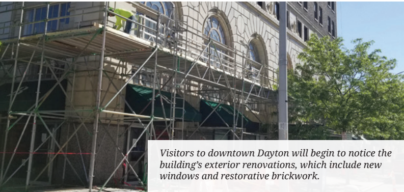
Visitors to downtown Dayton will begin to notice the building's exterior renovations, which include new windows and restorative brickwork.