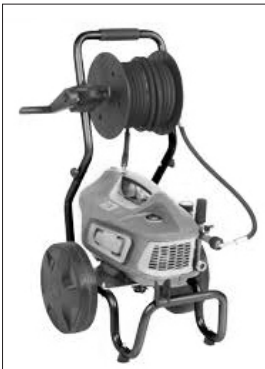
Code: KTRI40419 Hose Reel Kit for Trolley (optional accessories)