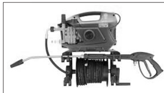
Code: KTRI40418 Wall Support Kit and Hose Reel (optional accessories without hose)