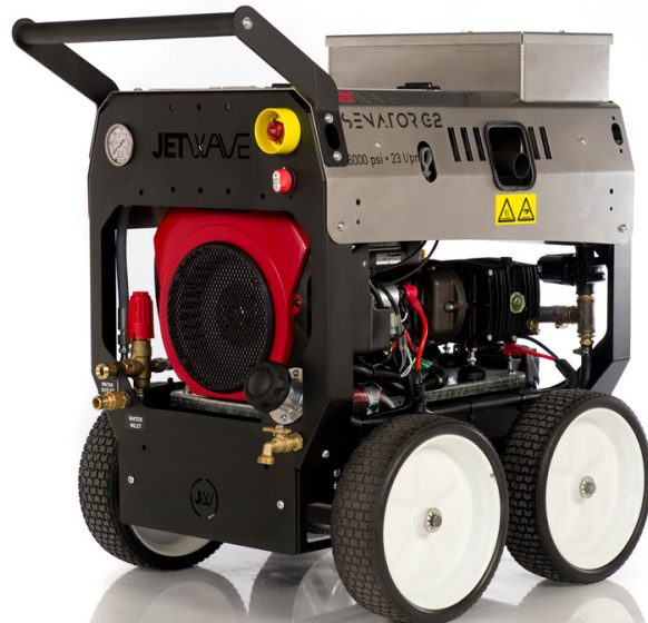
*SHOWN WITH OPTIONAL WATER TANK