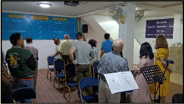
We will follow the 2 Pillars and the vision of SIBC.