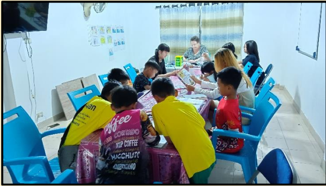
Children learn about Jesus through activity books.