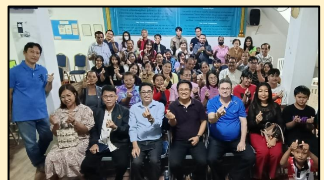
We will take God's love to the people in Khon Kaen.