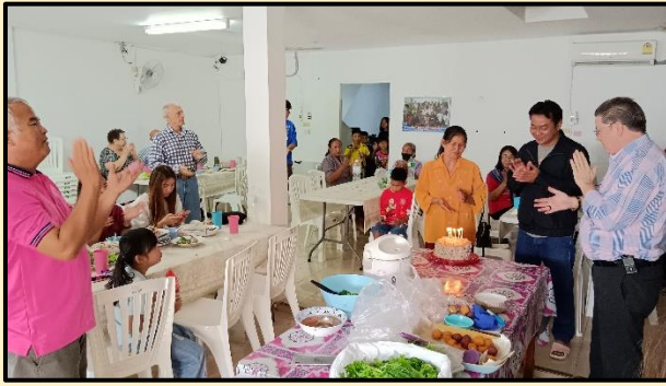
We celebrate birthdays at the end of every month.