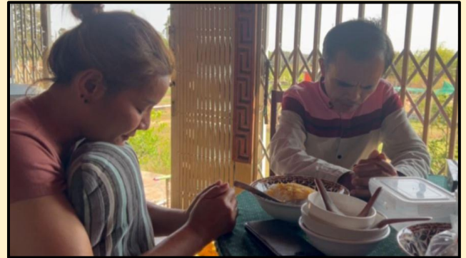
She prayed to accept Jesus as her Lord and Savior.