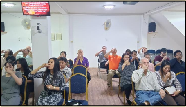
We take the Lord’s Supper on every first Sunday.