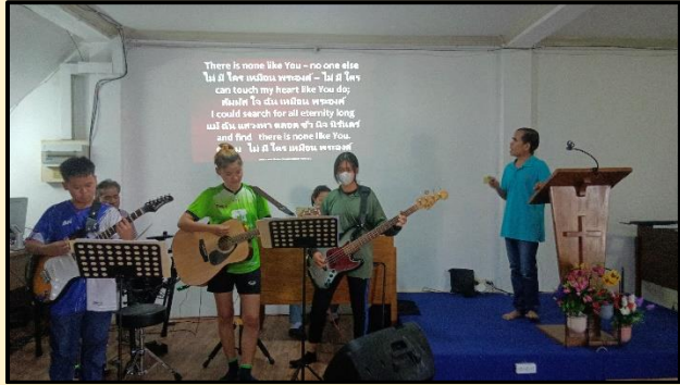
We practise the worship on every Saturday at 2 p.m.