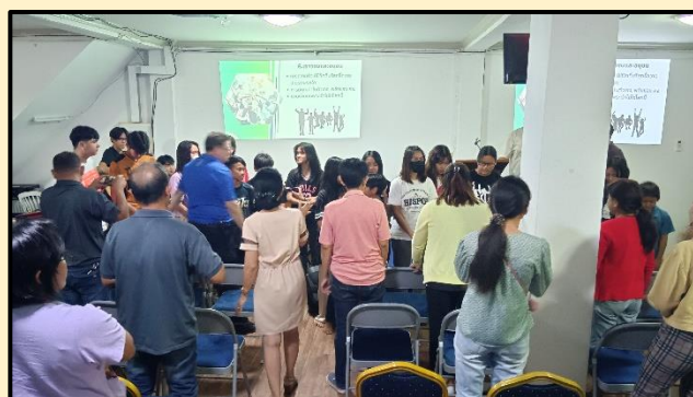
12 churches came to pray for Khon Kaen at SIBC.