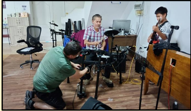
We bought a new drum set for the worship ministry.