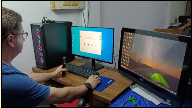
We bought a new computer for the worship ministry.