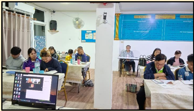
We studied about prayer on Wednesdays in January.