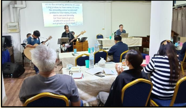
We worship God before we study on Wednesday night.