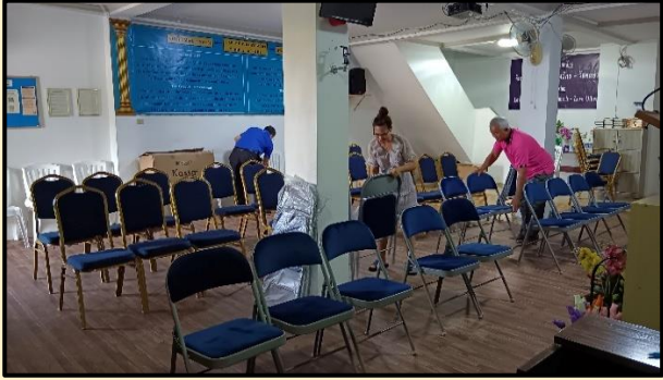
We bought 15 new chairs as we have more people.