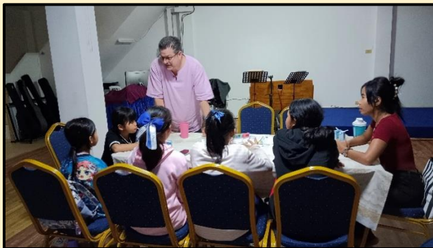
These students are from the Christmas outreach.