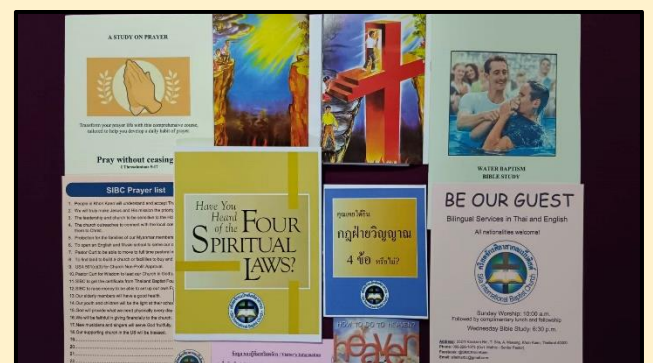
We provide materials about prayer and evangelism.