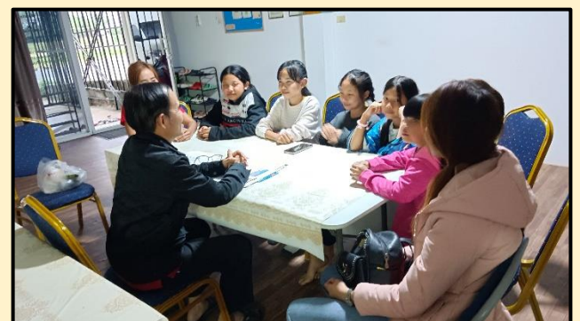
We offer free English class to tell them about Jesus.