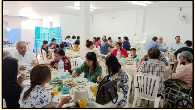
We fellowship at lunch time on every Sunday.