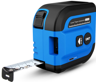
NF-2260L Laser Tape Measurer 1. Tape & Laser measurement. 2. Length, area and volume modes. 3. Max range: 60m. 4. Battery type: rechargeable Lithium battery.