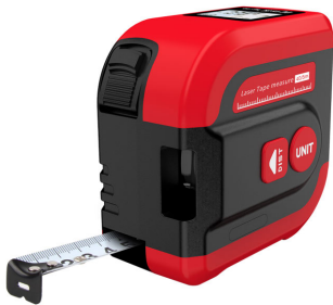
NF-2240 Laser Tape Measurer 1. Tape & Laser measurement. 2. Length, area and volume modes. 3. Max range: 40m. 4. Battery type: 1.5V 2*AAA.