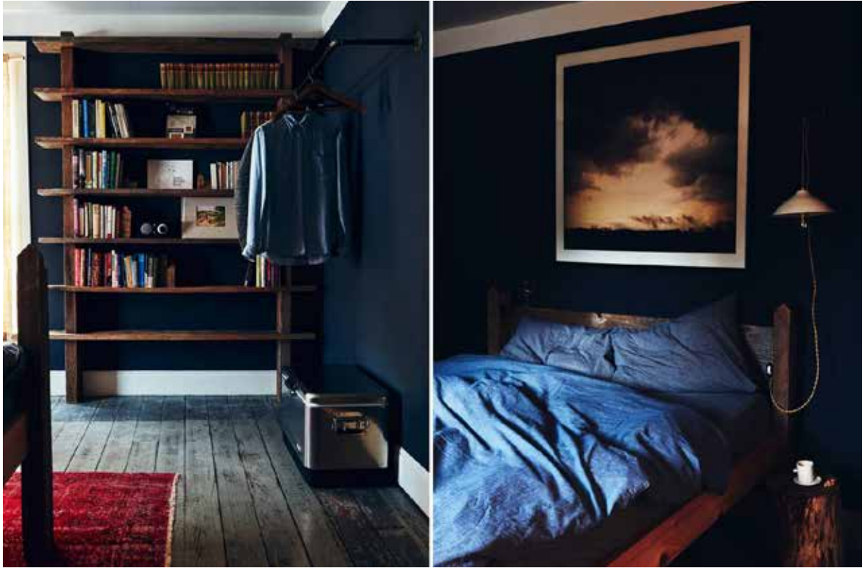
Table on Ten has three rooms available via AirBNB. All three spaces echo an atmosphere and esthetic of the cafe, offering the facility to enjoy the life, food and community that center around Table on Ten.

The 'attic' is an ensuite room accessed by a central staircase. It has views in all directions and boasts a hand-made, reclaimed barn wood king sized bed. A claw foot tub floats effortlessly in the room with the ability to enjoy the view of neighboring farmland.