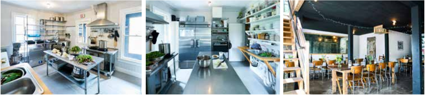
Table on Ten is a haven for locals and weekends alike serving as a farm to table restaurant and inn since 2012. A turnkey business opportunity with interior dining accommodating 65 and additional outside seating with a stage for entertainment. It is a culinary destination voted "207 greatest restaurants in the world to eat" by Conde Nast Traveller.

Table on Ten is being offered as a TURNKEY BUSINESS with established FARM RELATIONSHIPS and loyal CUSTOMER BASE. Endless possibilities for growth and expansion with WEDDING & EVENTS opportunities. A PROFITABLE history will be shared with qualified buyers.