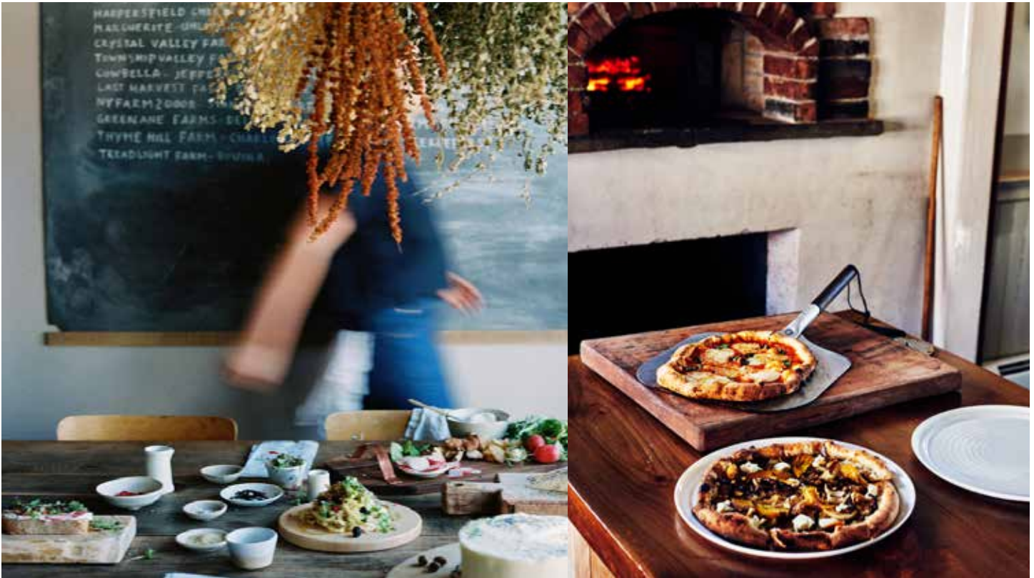
TABLE ON TEN