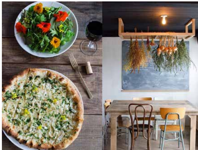
Table on Ten is being offered as a TURNKEY BUSINESS with established FARM RELATIONSHIPS and loyal CUSTOMER BASE. Endless possibilities for growth and expansion with WEDDING & EVENTS opportunities. A PROFITABLE history will be shared with qualified buyers.

Table on Ten is a haven for locals and weekends alike serving as a farm to table restaurant and inn since 2012. A turnkey business opportunity with interior dining accommodating 65 and additional outside seating with a stage for entertainment. It is a culinary destination voted "207 greatest restaurants in the world to eat" by Conde Nast Traveller.