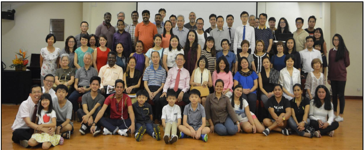
The church celebrated her first anniversary on 15th July 2018 with a resounding support from members and friends. More than 70 came together to encourage one another!