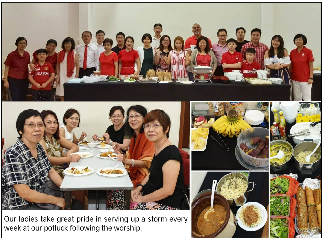
Our ladies take great pride in serving up a storm every week at our potluck following the worship.