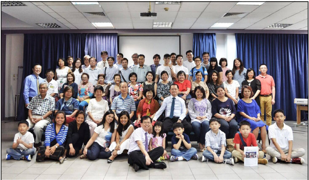
The first worship on 16th July 2017 at 6pm at the Salvation Army, Hillview was attended by many family members, friends and well-wishers. The Household of Faith was on to a good start.