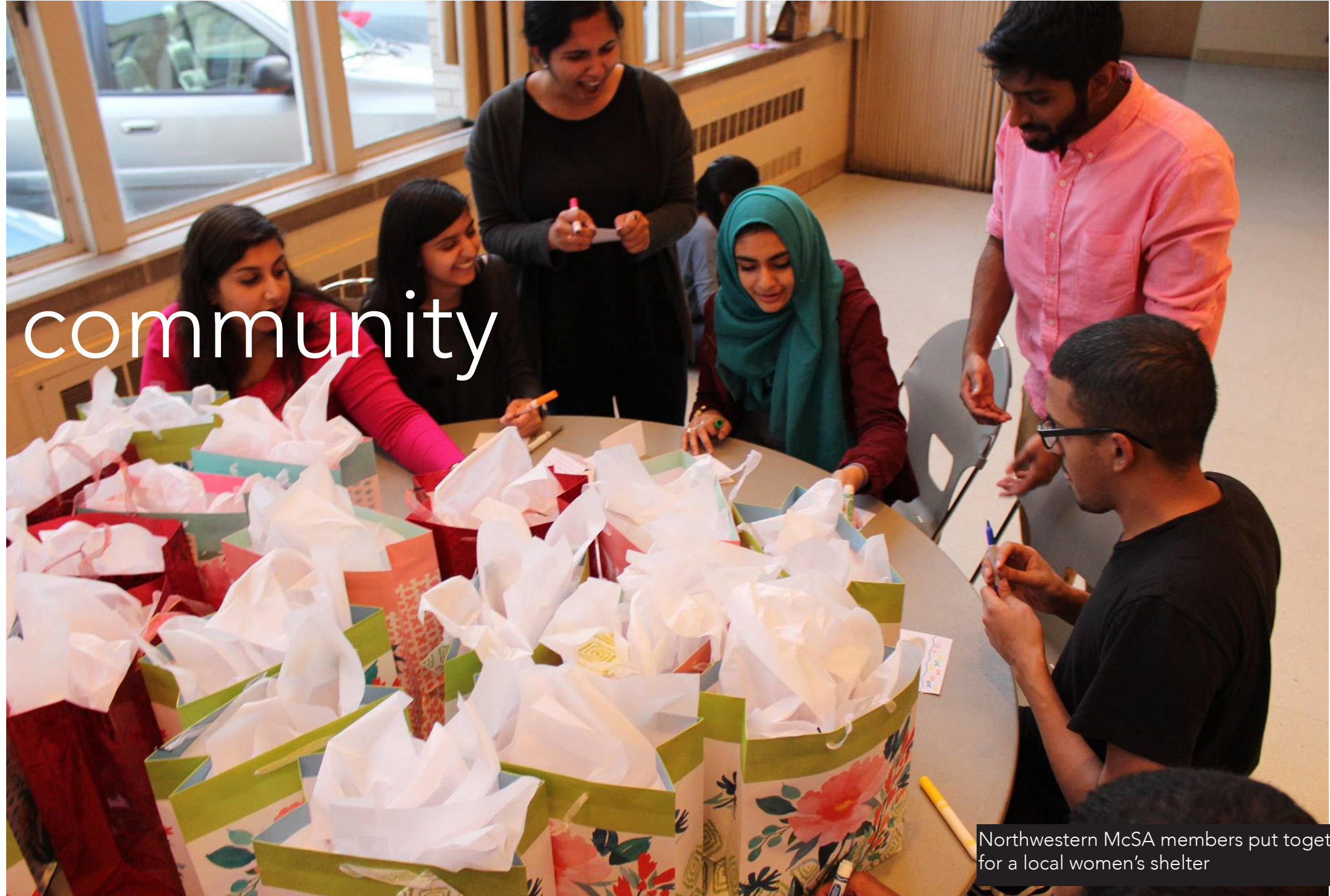
Northwestern McSA members put together care packages for a local women's shelter