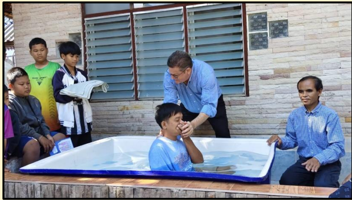
X was baptized on November 30 th .