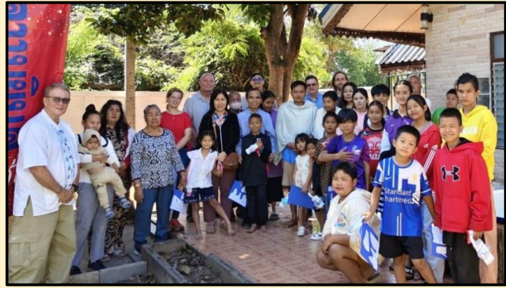
We witnessed their first obedience to Jesus Christ.