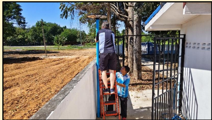
A solar light was installed near the 2 bathrooms.