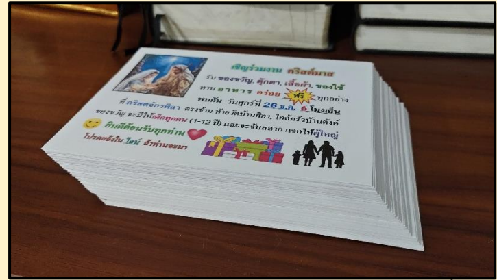
We are praying for 300 people to come on Dec. 26 th .