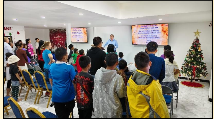
We had joy to worship God in a Christmas atmosphere.