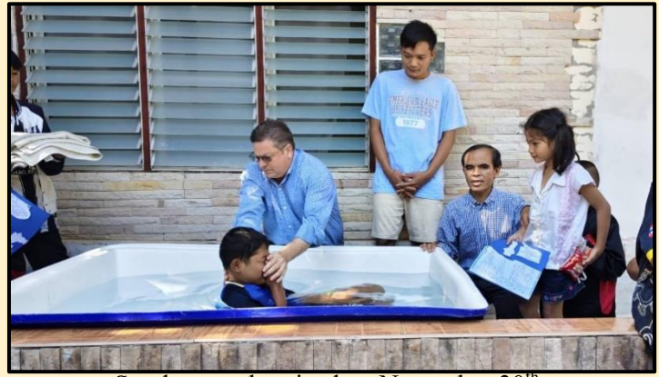
Sunday was baptized on November 30 th .