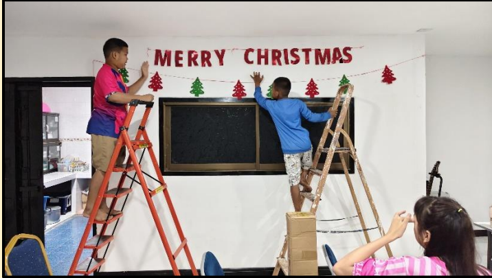
We started Christmas decorations on November 15 th .