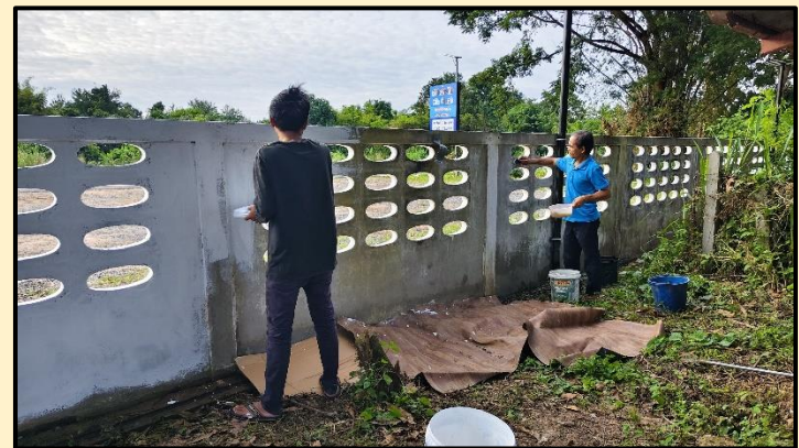
We painted every wall to update the property.