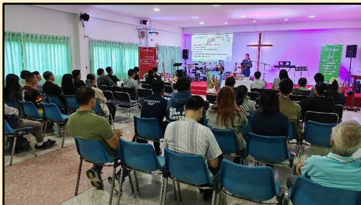
Daeng went for OCC training for gifts for next year.