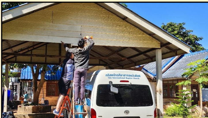
Security camera was set up outside the church.