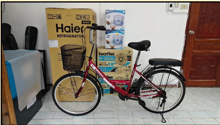
Some gifts for our Christmas Outreach on Dec. 26 th .