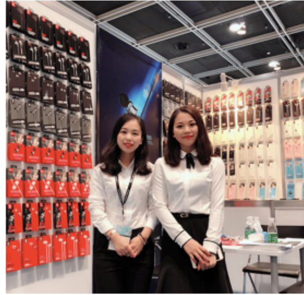
2018 HKTDC Exhibition