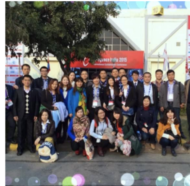
2015 India Exhibition