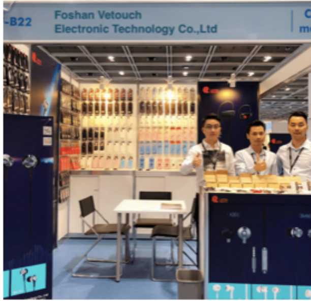
2019 HKTDC Exhibition