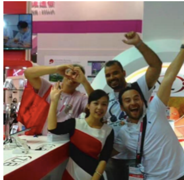
2015 Global sourcing Exhibition