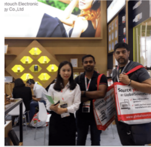
2017 Global Sourcing Exhibition