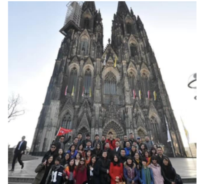
2014 Germany Cebit Exhibition