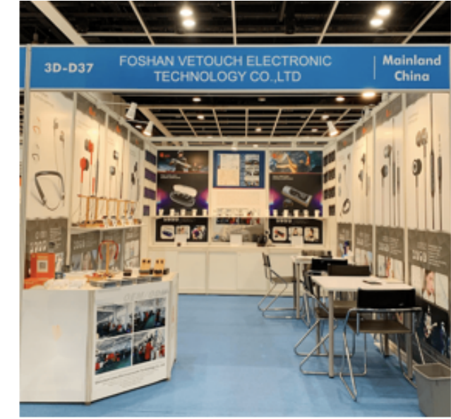
2017 CES, Las Vegas