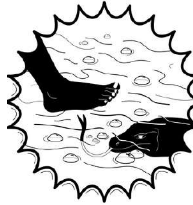
Logo Monitor Lizard House

In response to the work of Tomás Saraceno, Aerocene Explorer, Monitor Lizard House will devise sensing and visualization methods for the climate crisis that is eroding the coastal area in Southern Bangkok - Samut Prakhan.