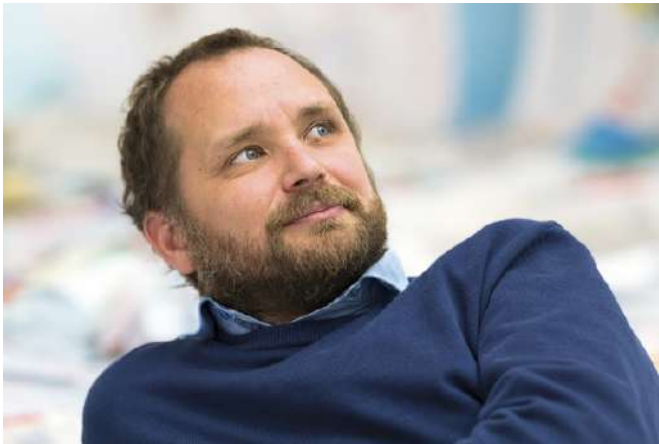
Tomás Saraceno.

Tomás Saraceno's practice is informed by concepts linking art, life science, and the social sciences. Enmeshed in the junction of these worlds, his floating sculptures, community projects, and immersive installations propose sensory solidarity with the planet through a social, mental, and environmental ecology of practice.