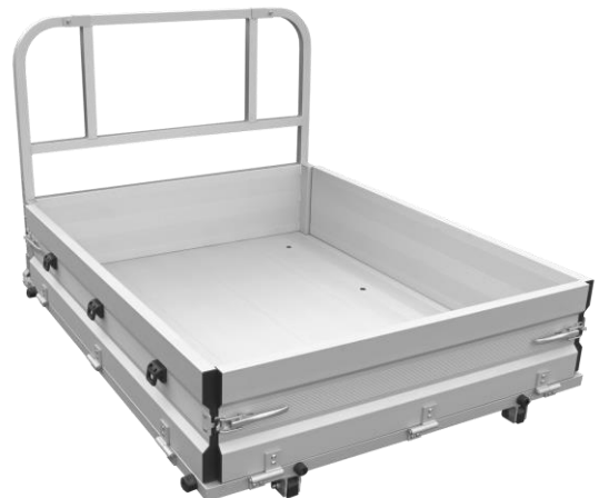
Pickup Steel Tray