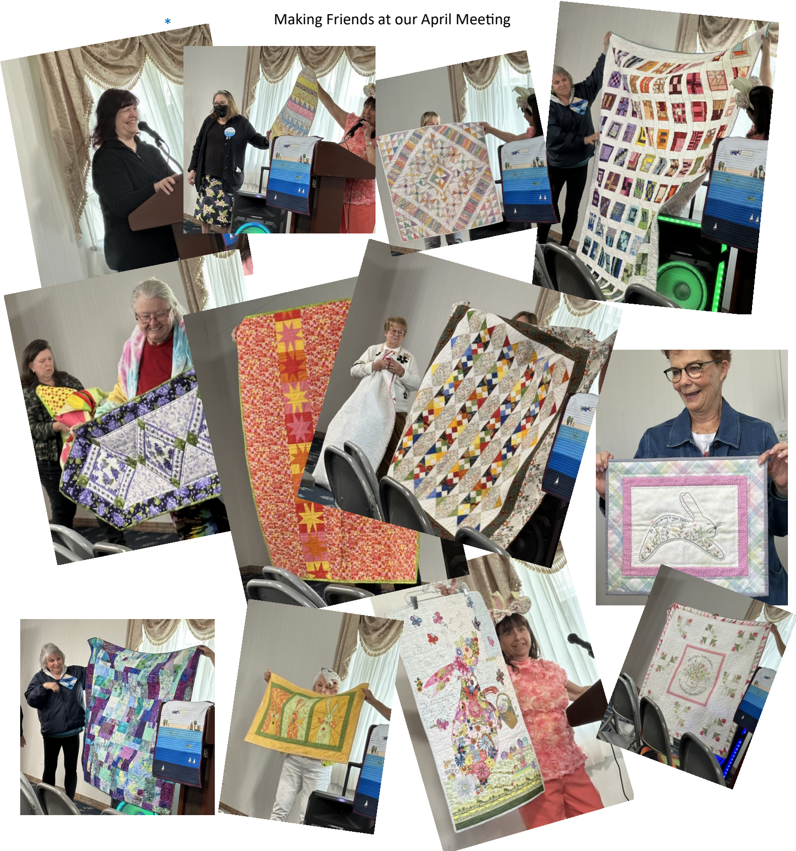
Making Friends at our April Meeting