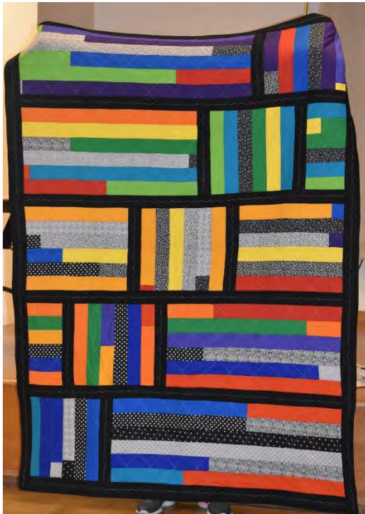
Completed quilt from the Jelly Roll Race Challenge with QBS in April 2019 – Third Place!