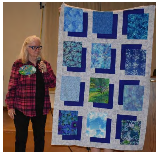
Phyllis C's latest beautiful work of art.