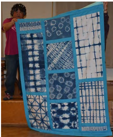
Shar's latest Shibori masterpiece. Also a sample of what's coming up in our June Workshop.