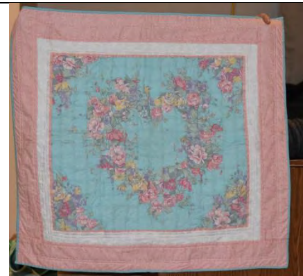
Phyllis Campbell's beautiful watercolor quilt.