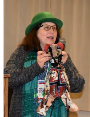
She finished it!! :D