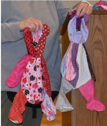
Finished Rare Bears, ready for stuffing.