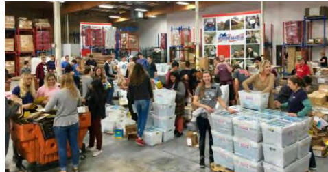
The FOB this morning in Chatsworth, CA