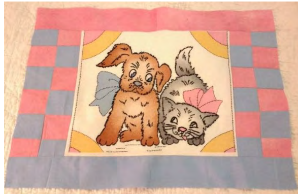
Hand Dyed Fabrics