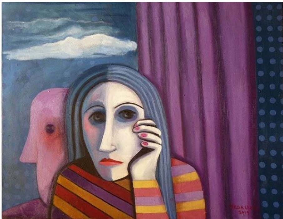
La atracción remota de un encanto (The remote attraction of a charm), 2019.