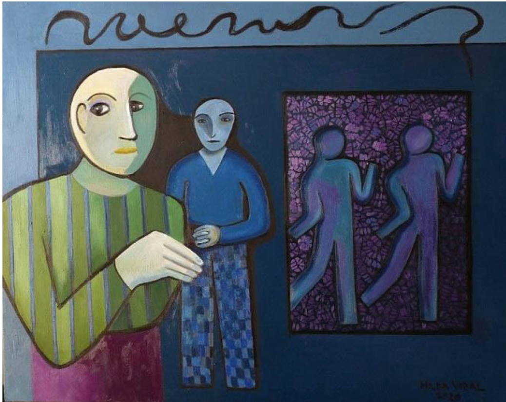
Las estrellas me abrasan los ojos (The stars burn my eyes), 2020. Oil on canvas, 32 x 40 in.