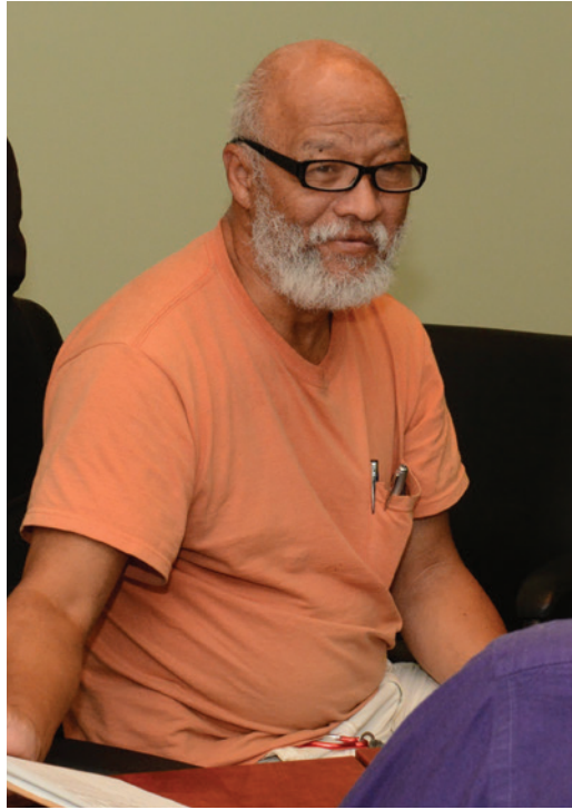
St. Mary Resident Finds Beauty in COVID-19 to Get Through Hard Times

"This pandemic happened for a reason: to pull mankind together so we realized we're all in the same boat. We're all in this together. There's a lot of beauty in the tragedy."