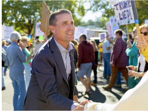
Mike McGuire – The Plumas Sun

At its statewide convention in San Francisco on Sunday, February 22, State Senator Mike McGuire , D-Healdsburg, won 74% of delegate votes to capture the party endorsement in the June 2 primary for the newly re-drawn 1st Congressional District seat. This district now includes most of Lake County. McGuire has represented the County in the State Senate since 2014 and became President pro Tempore of the Senate in 2022.