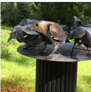
Hangin' Out Judd Nelson $10,000

(all sculptures shown are available for purchase)