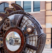
Mechanical Guppy Tim Nelsen $8,800

(all sculptures shown are available for purchase)