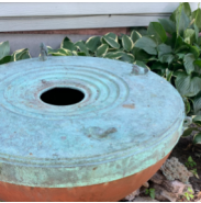
Sacred Nature/Sacred Culture I Wayne Potratz $5,000