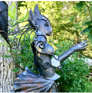
Strolling With The Wind Susan Suess $4,900

(all sculptures shown are available for purchase)