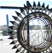
Nurturing Mark Hall $14,000

(all sculptures shown are available for purchase)