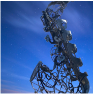
Saxophone Victor Yopez $3,000

(all sculptures shown are available for purchase)