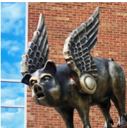
Time To Fly Kyle Fokken $10,000