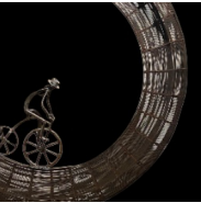
Infiniticycle Victor Yopez $3,000