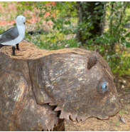
Little Bear Judd Nelson $10,000

(all sculptures shown are available for purchase)