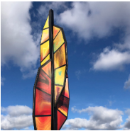
Pluma Sculptura/Feather Kirk Seese $7,500

(all sculptures shown are available for purchase)