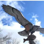
Out On A Limb Paul Albright $13,500