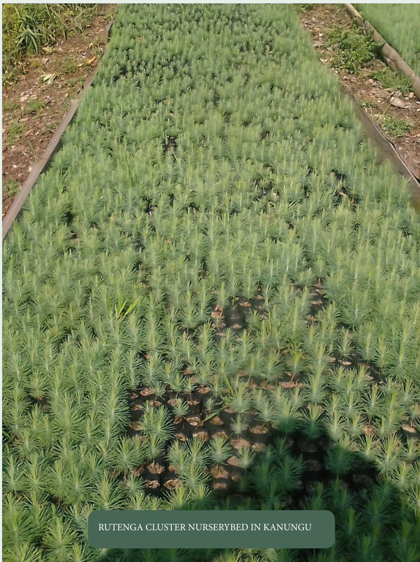
RUTENGA CLUSTER NURSERYBED IN KANUNGU