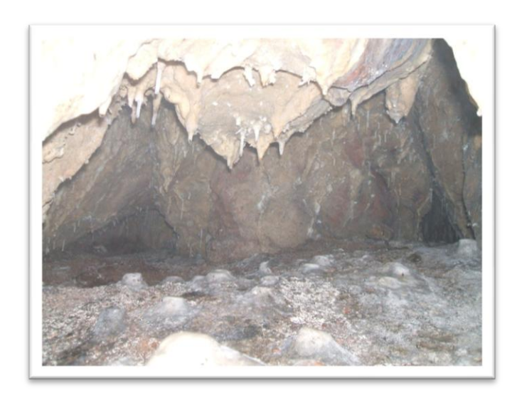
Inside the Dropping Cave

age allows someone to simply pull themselves in to the confines of the cave. Inside, it is dark, dank and extremely wet and certainly confining enough to ensure that "The Great Stone" was never lifted within its restricted space. One of the stank entrances mentioned by Miller is clearly obvious and with the allure of a secret chamber, Roger made a sustained effort to push himself inside with the only consequence being that he was becoming even more saturated with each attempt.